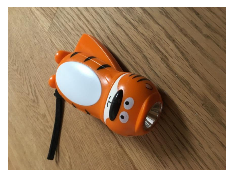
Figure 2: A tiger shaped hand generator LED torch

There are of course multiple combinations of the Morphological Box allowing for the creation of multiple while system concepts that can be evaluated to find the "best"